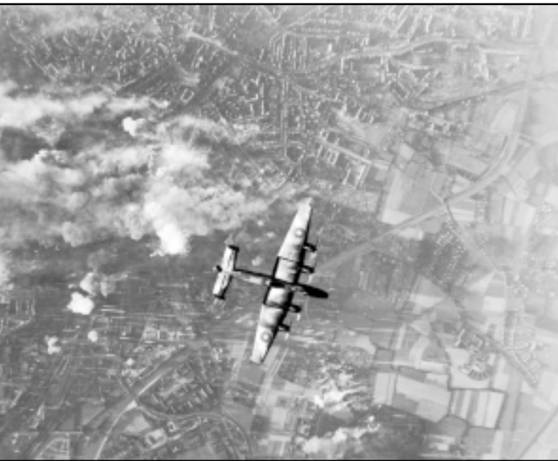
PL 144277