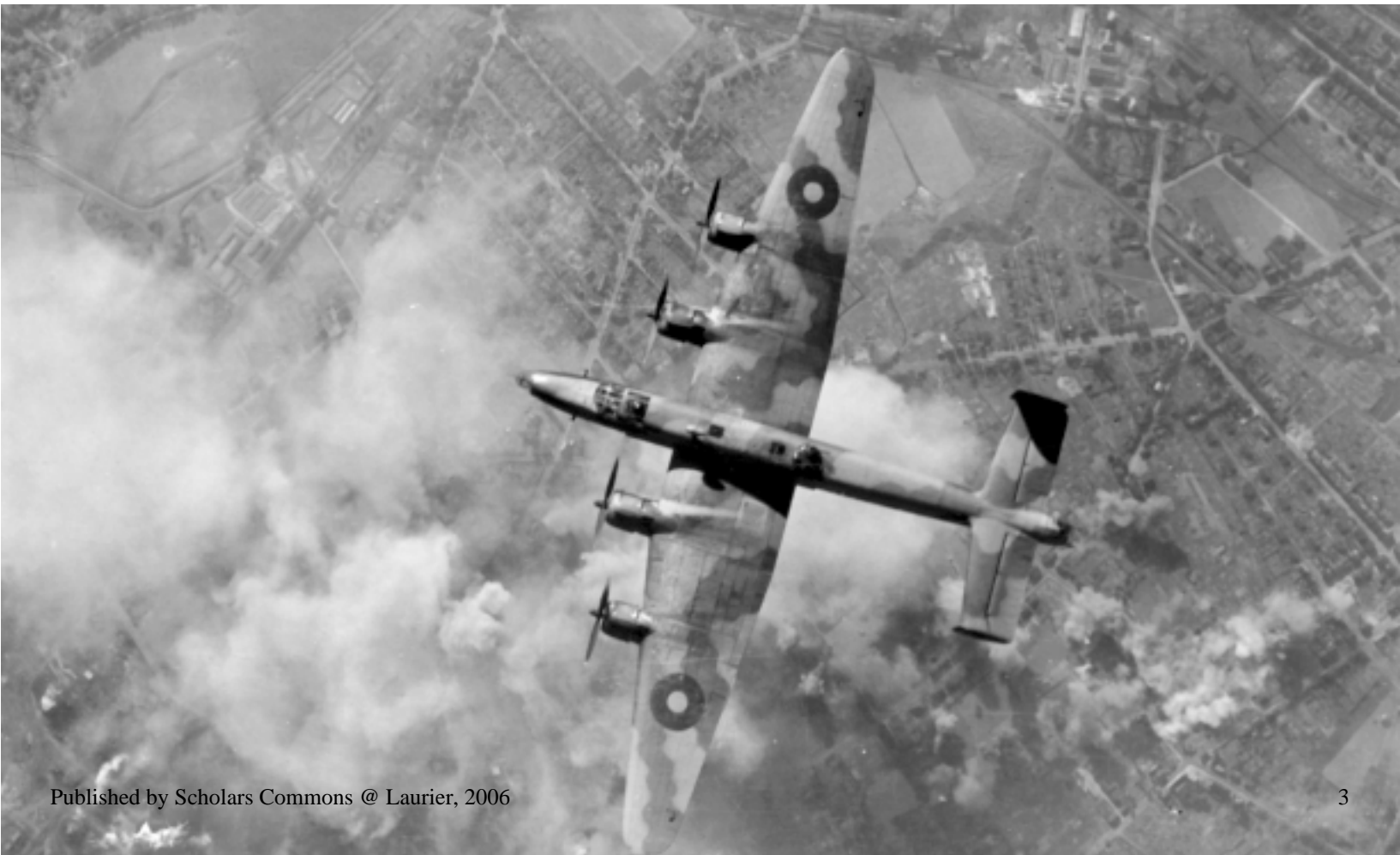
A Halifax of 6 Group RCAF makes a daylight attack on an oil refinery in the Ruhr during October 1944.

With the Allied victory in Normandy control of Bomber Command returned from General Eisenhower's headquarters to the Royal Air Force, which reassessed its strategy. There were important new opportunities, because the progress of Allied ground forces deprived the Luftwaffe of its forward air defence radars, meaning that Allied bombers would encounter much less effective interception. 15 The debate as to what should have priority turned on three major target systems: oil, communications and transport, and industrial areas. Air Chief