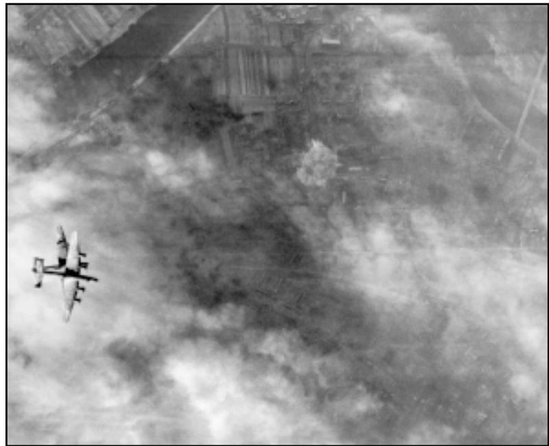
Above left: An Avro Lancaster attacks the city centre of Münster, Germany, 19 September 1944. Above right: Two Lancasters have a close encounter during a daylight mission over Koblenz, Germany, 29 December 1944. Both aircraft made it back to base. This mission was undertaken to interdict the railway yards in Koblenz, which were one of the main transportation hubs supporting the German attack in the Ardennes.

Marshal Portal favoured oil as the primary target objective in shutting down the German war machine, a view advocated by General Carl Spaatz, commander of the US Eighth Air Force. Air Chief Marshal Arthur Tedder, deputy commander to General Eisenhower, believed that a broader effort to destroy the enemy's transportation and communication capabilities, as the bombers had already successfully done in France in preparation for the Normandy invasion, would paralyze the enemy's war-making abilities much more quickly than an assault on oil resources. 16 As always, Arthur Harris preferred area targeting of German cities. 17 Throughout 1944 Harris continued to refer to both oil and transport as "panacea" targets, insisting that the destruction of a single type of target would never bring Germany to its knees. Harris, however, was also subject to the decisions of others, and would prove to be a more or less obedient agent of senior authorities.