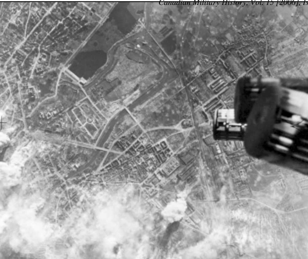
These two photographs show the daylight raid on Hannover, Germany. This was one of three daylight attacks carried out by Bomber Command on 25 March 1945 (the others were against Münster and Osnabrück) designed to interdict the main reinforcement routes into the Rhine battle area. The attack on Hannover was carried out by 267 Lancasters and 8 Mosquitos from 1, 6 and 8 Groups. One Lancaster was lost.