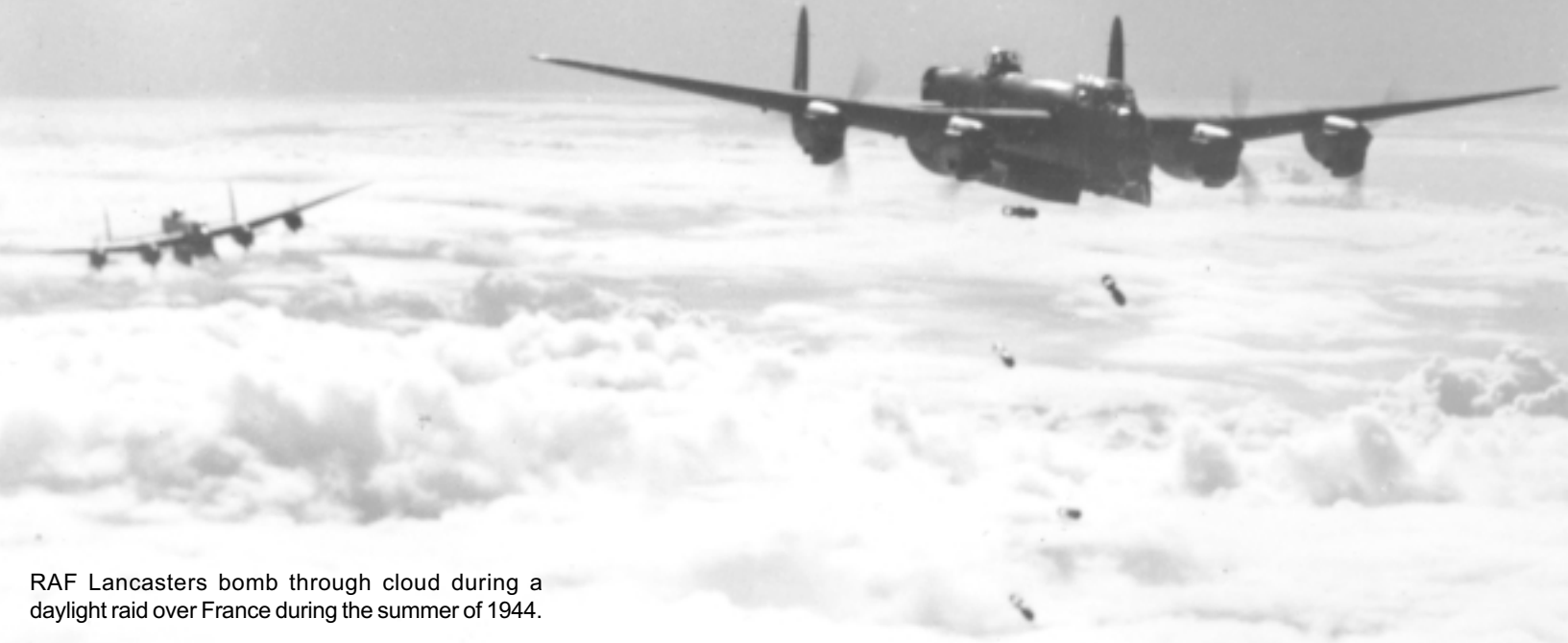
RAF Lancasters bomb through cloud during a daylight raid over France during the summer of 1944.

returned to large-scale daylight operations in 1944-1945. The availability of aircraft and crews had increased from 506 in November 1941 to 1,609 by April 1945. The light, two-engined bombers had been completely replaced by heavy four-engined aircraft that could carry much larger payloads further, with the formidable Avro Lancaster accounting for the majority of planes available (1,087) by the last few months of the war. 8 The lightweight wooden de Havilland Mosquito was also available in large numbers. Originally put into service to find and mark targets, the speed (350 mph) and ceiling (33,000 feet) of the Mosquito made it invaluable as a bomber as well. 9