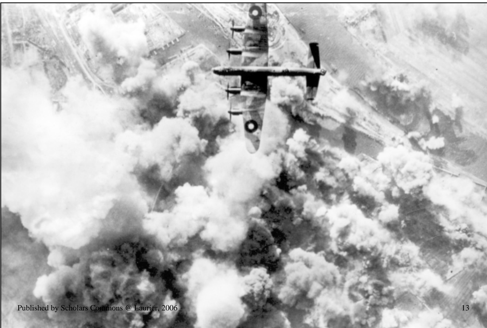
A Lancaster makes a daylight raid against an enemy dockworks.

According to one recent study, RAF crews were more successful than their counterparts in the USAAF in locating and striking a target when visual aiming was not possible. 114 This ability was a direct result of the extensive training British crews received on navigation aids. The devices which allowed Bomber Command crews to find a target at night proved equally as effective in